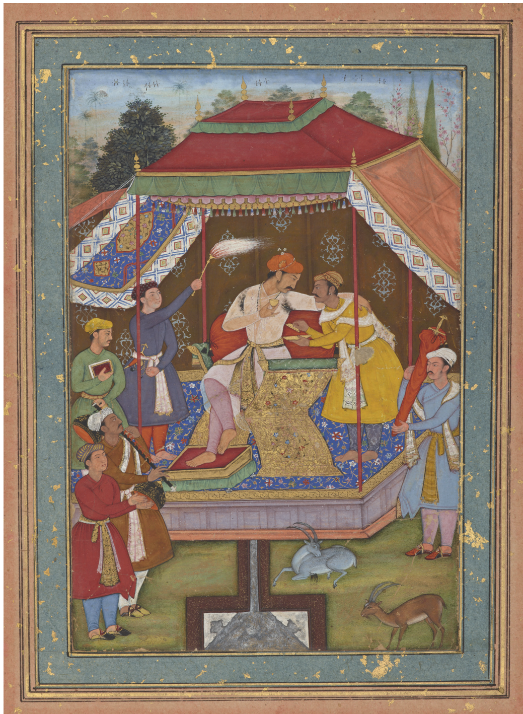
FIGURE 2. Attributed to Sur Das, A Royal Entertainment , India, Mughal dynasty, ca. 1600. Opaque watercolor and gold on paper, 17 x 11.4 cm

free of bright colors, embroidery, or any other finery, even if the cloth was very soft and light in the summer. Accounts from William Thevenot, a seventeenth-century European traveler at Jahangir's court, suggest that the white jāmas seen in Mughal paintings were almost all made of cotton for reasons of both comfort and cleanliness. B. N. Goswamy quotes Thevenot as writing that the jāmas were "commonly made of white stuff, that's to say of cotton-cloth, the end they may be the lighter, and the neater by being often washed; and that agrees with the fashion of