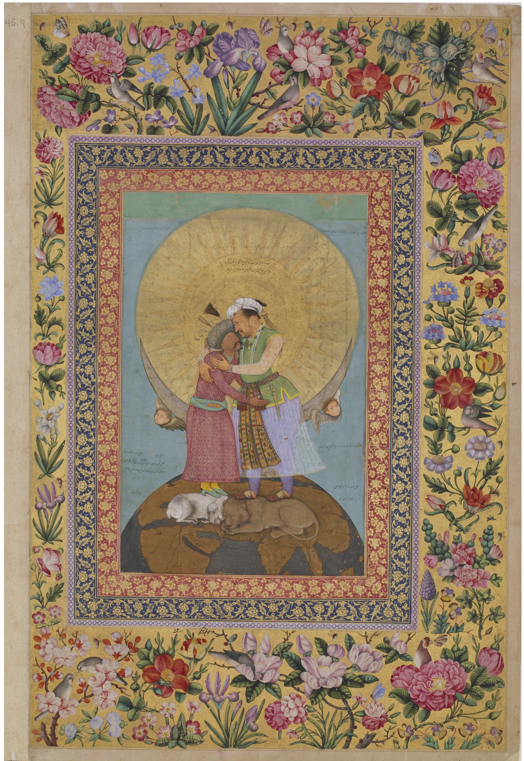
FIGURE 4. Abu'l Hasan, Jahangir Embracing Shah Abbas , India, Mughal dynasty, ca. 1618. Opaque watercolor, ink, silver, and gold on paper, 23.8 x 15.4 cm