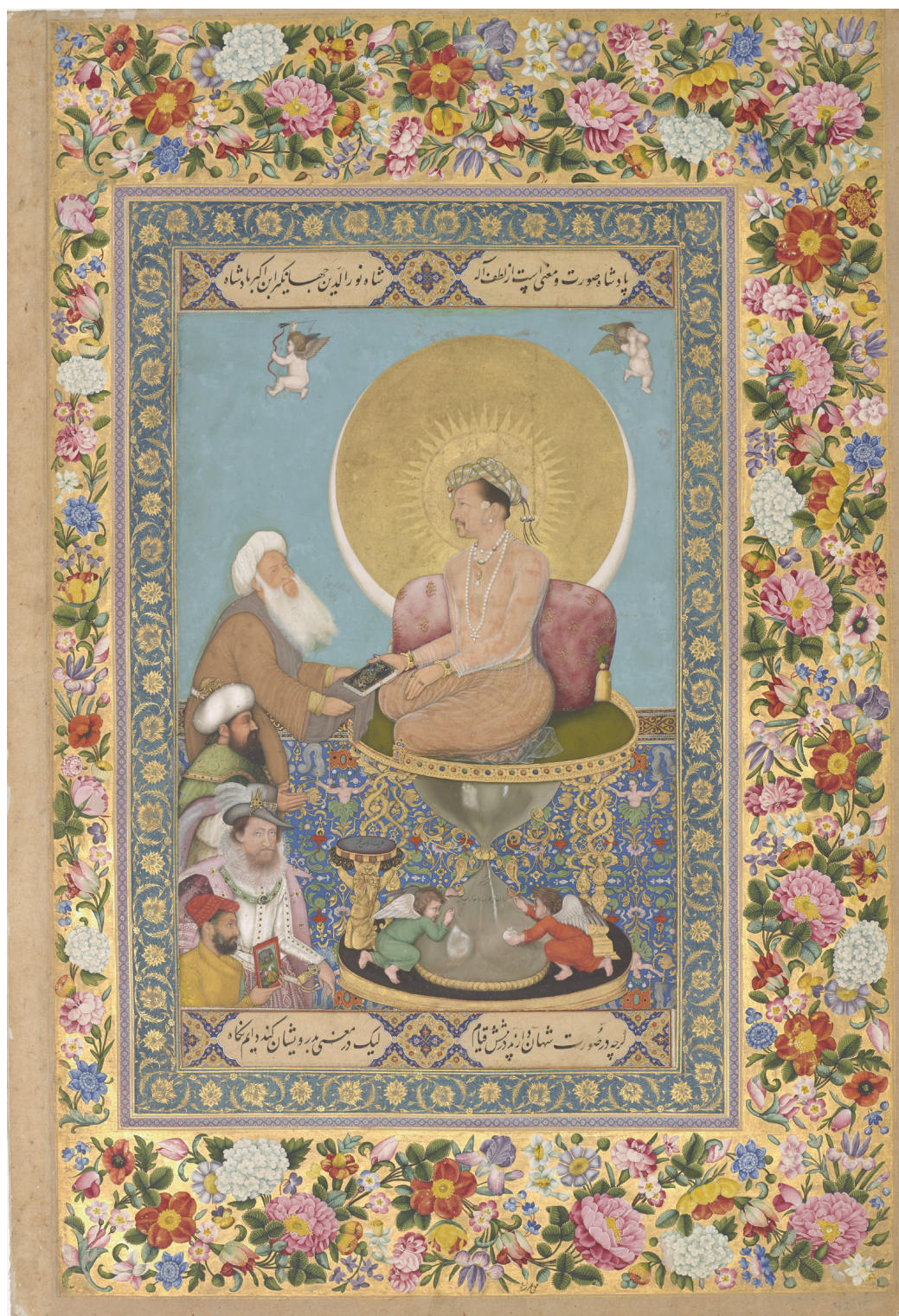
FIGURE 3. Bichitr, Jahangir Preferring a Sufi Shaykh to Kings , India, Mughal dynasty, ca. 1615–18. Opaque watercolor, ink, and gold on paper, 25.3 x 18.1 cm