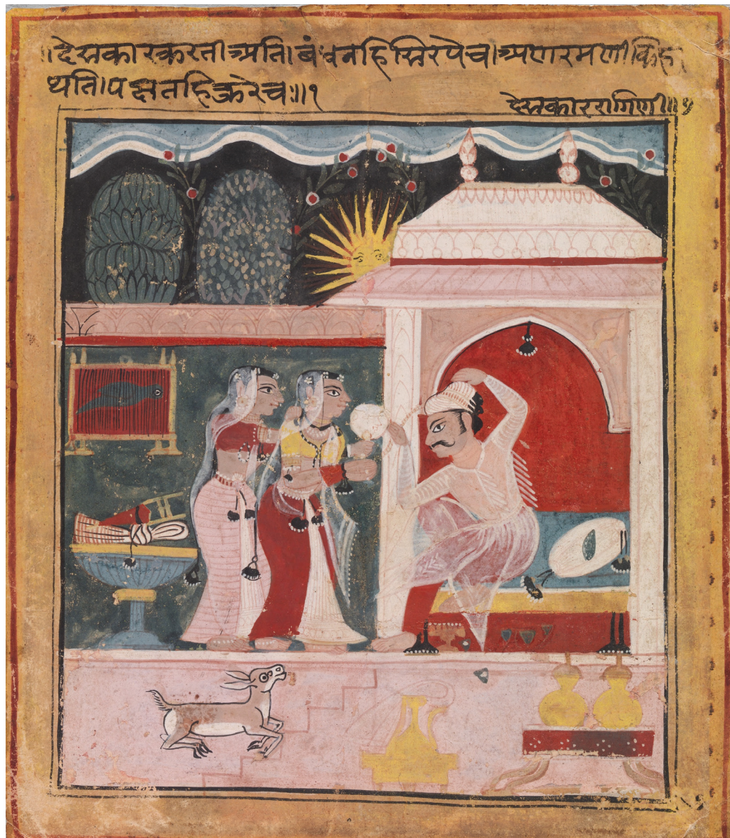
FIGURE 1. Nasiruddin, Deshakar Ragini: A Prince Looking in a Mirror Tying His Turban , illustrated folio from the dispersed “Chawand” Ragamala , Rajasthan, kingdom of Mewar, 1605. Opaque watercolor on paper, 16 x 14.6 cm

the cloth-of-gold in cost, as the price for an ambiguously defined “piece” of cloth could range from three rupees to fifteen mohurs (almost two thousand dollars in contemporary prices). 44