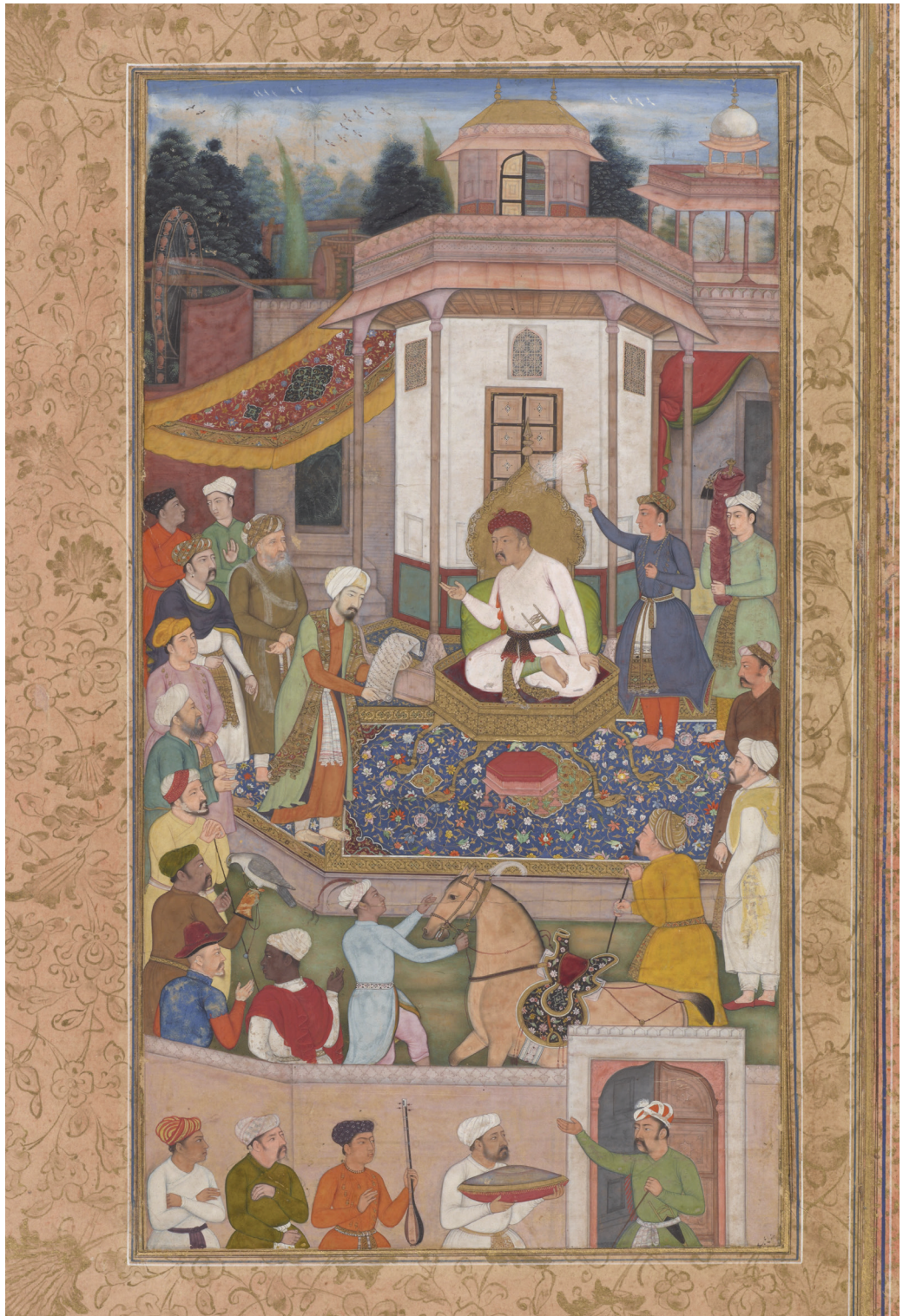
FIGURE 5. Attributed to Manohar, Akbar Receives News of the Victory at Gogunda , from an Akbarnama , India, Mughal dynasty, reign of Akbar, ca. 1596–1600. Opaque watercolor, ink, and gold on paper, 26.3 x 14.2 cm