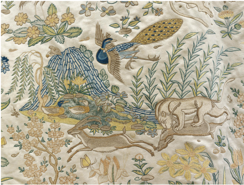
FIGURE 6 AND 7. Hunting coat, India, Mughal dynasty, ca. 1620–30. Embroidered satin with silk, 97 x 91.44 cm